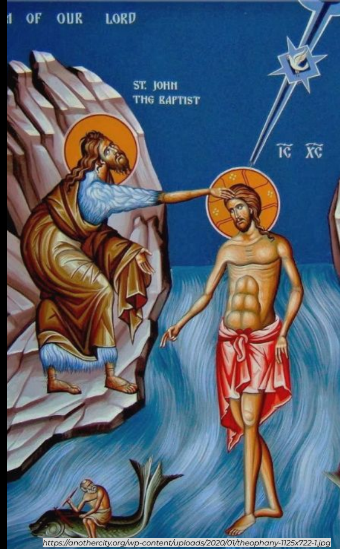
ST. JOHN THE BAPTIST