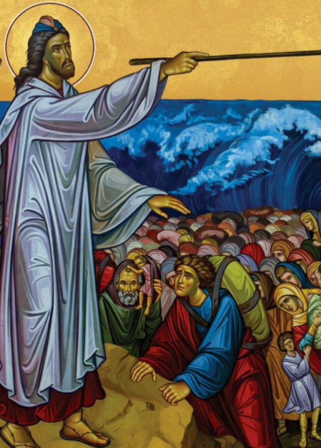
PROPHET MOSES AND THE CROSSING OF THE RED SEA

“Your way was through the sea, your path through the mighty waters; yet your footprints were unseen. You led your people like a flock by the hand of Moses and Aaron.”